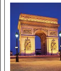
Arc de Triomphe