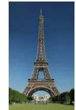
The Eiffel Tower