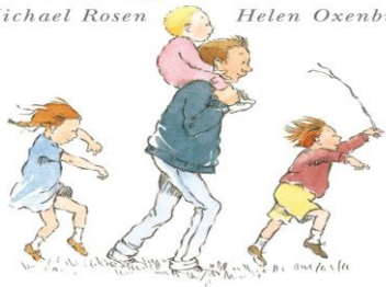
We're Going on a Bear Hunt Michael Rosen Helen Oxenbury